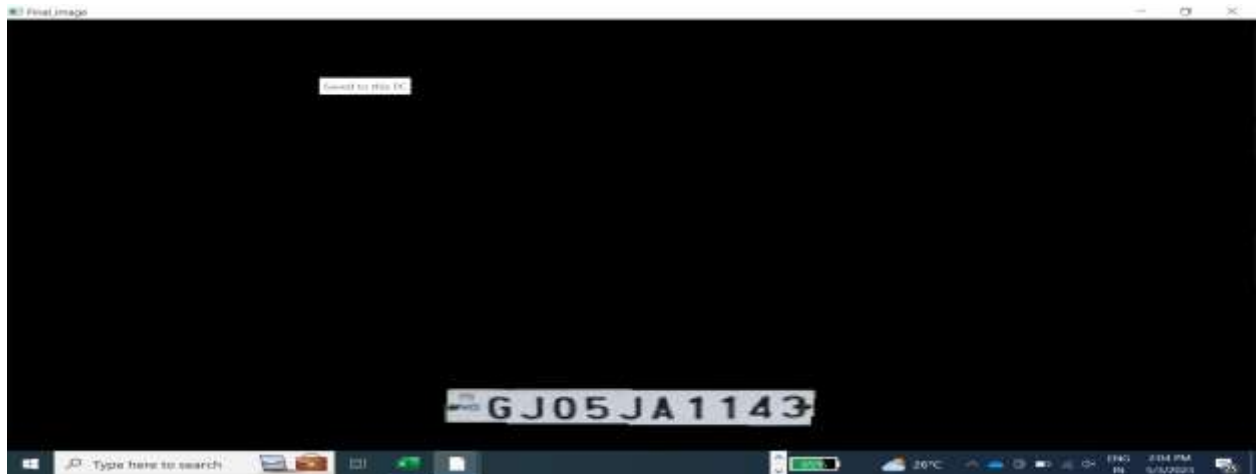
Fig 2. Detecting only the Number Plate of the Vehicle